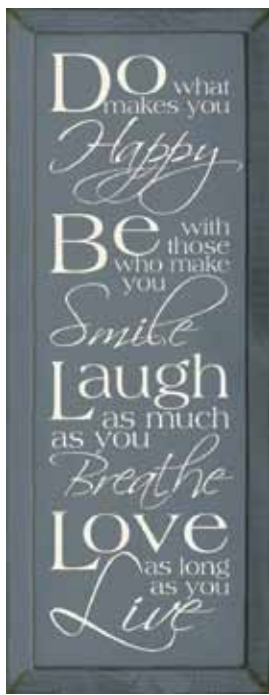
The "Do What Makes You ..." wall hanging from Sawdust City (800/528-6008 or www.sawdustcitywholesale.com ) brings interest to room accents with its artistic arrangement of fonts and words. Suggested retail: $21.