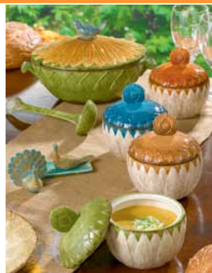
The New Fall Traditions 2010 catalog from Grasslands Road (914/345-2020 or www.grasslandsroad.com ) includes the Indian Summer collection composed of a large tureen with ladle, small tureen, cheese tray, sunflower bowl and sunflower au gratin dish. Suggested retail: $15-$66.

Consumers decorate their homes to reflect their own personalities, so someone in search of countrypolitan décor will, naturally, favor natural imagery with a casual elegance. Sorella Home is tapping into this refined rustic look with its new Ernest Hemingway licensed collection. Although the company's approach is young and modern for today's