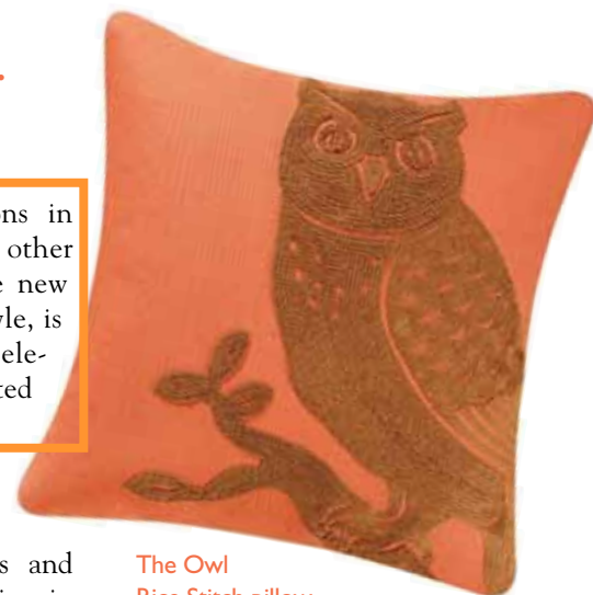
The Owl Rice Stitch pillow from C & F Enterprises (888/889-9868 or www.cnfei.com ) has a textural rice-stitch embroidery on a cotton canvas. Suggested retail: $39.99.