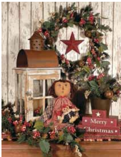
The new Country Christmas Florals line from The Country House Collection (410/749-9420 or www.thecountry-housecollection.com ) combines berries, rusty bells and stars, and greenery to create a country Christmas look. Suggested retail: $2-$29.50.

customers in turn exert a great deal of influence on the final products, as the company continuously responds to their feedback and special requests.