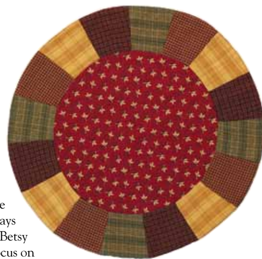
The 15" patchwork tablemat in the Nancy's Nook line from Victorian Heart (888/334-3099 or www.victorianheart.com ) can be used as a placemat or end-table cover. Available in 17 other designs. Suggested retail: $9.99.

collection called Farmer's Market with chickens, roosters and pigs, which are very popular." Farmer's Market, she says, is one of the best collections in the company's catalog. When lines such as these perform well, Caffco is apt to keep the products for another year, too.